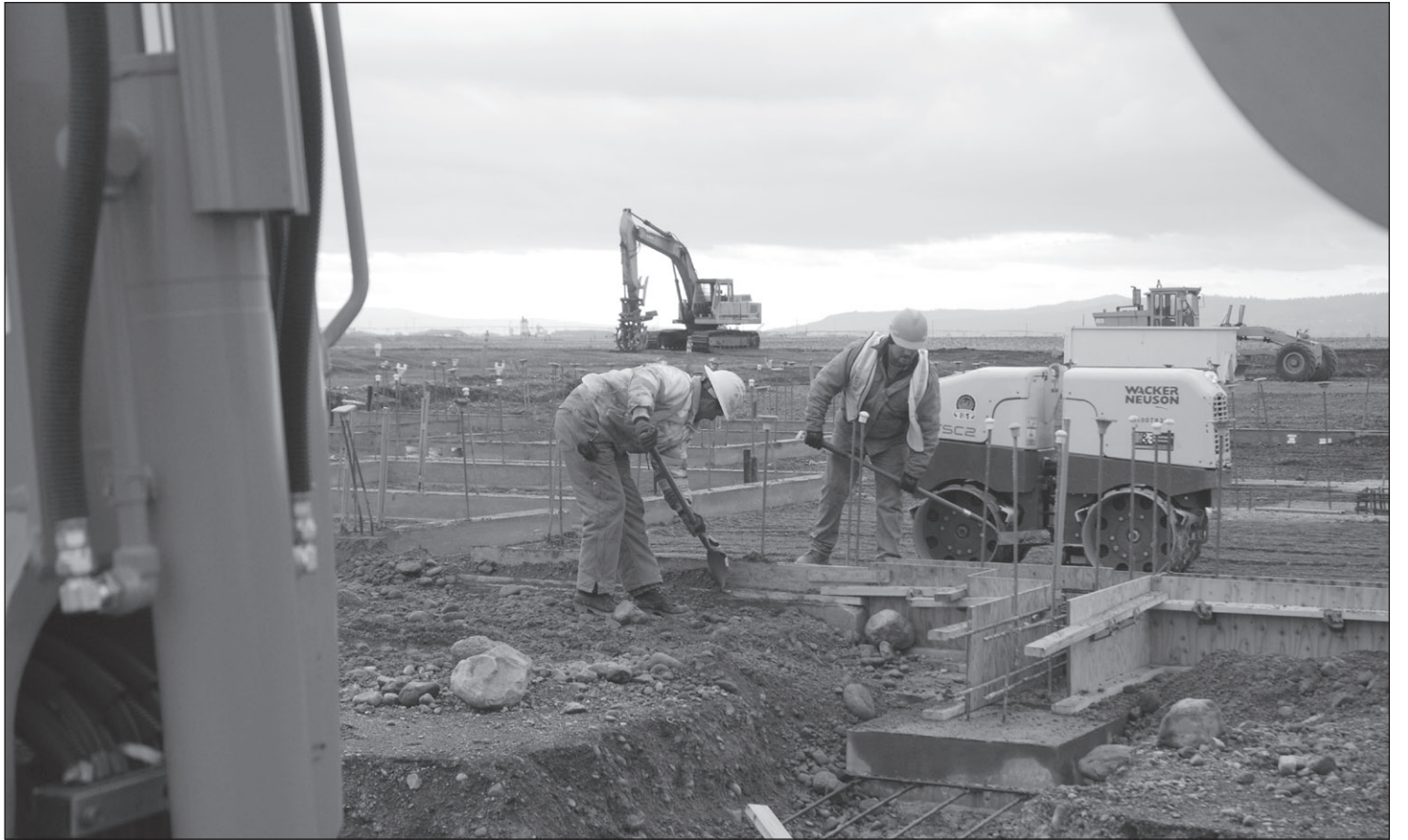
Crews prepare the necessary forms for the concrete foundations of the future Kootenai Technical Education Center (KTEC) under construction at Lancaster and Meyer Roads.