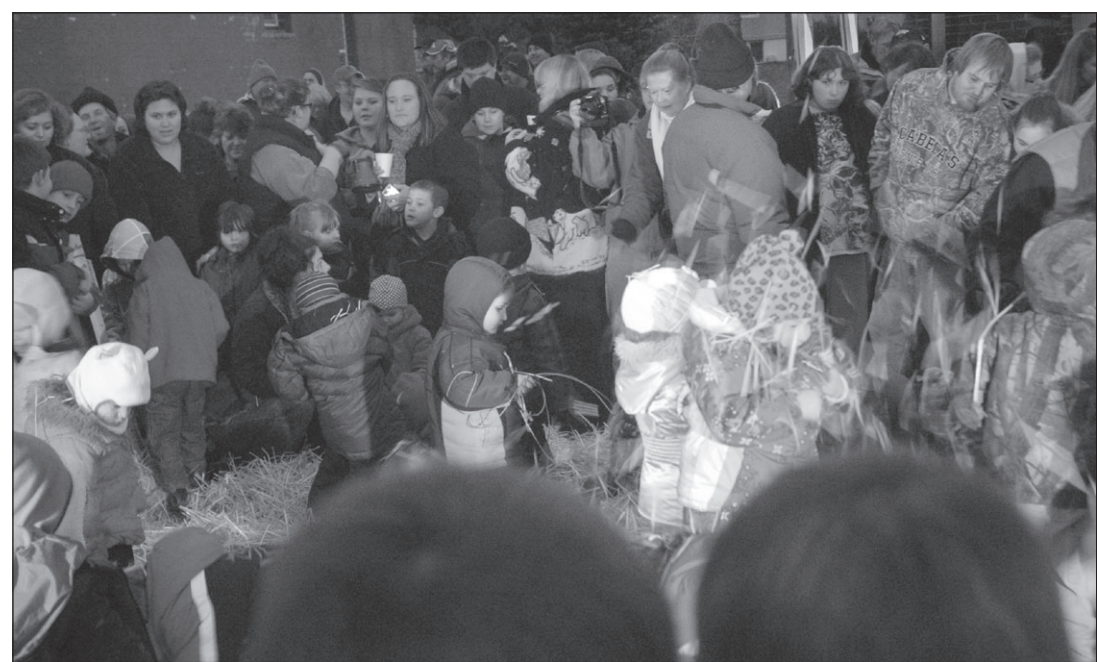
Straw goes a-flying as youngsters scramble for coins and prizes in the annual Dash for Cash.