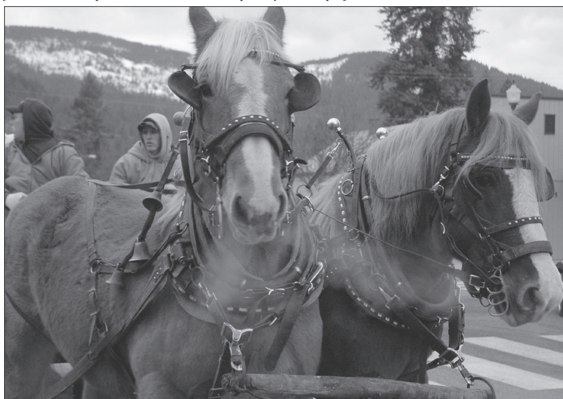
Bonnie and Charlie stand ready for the Giddy-up command and another Hayride tour.